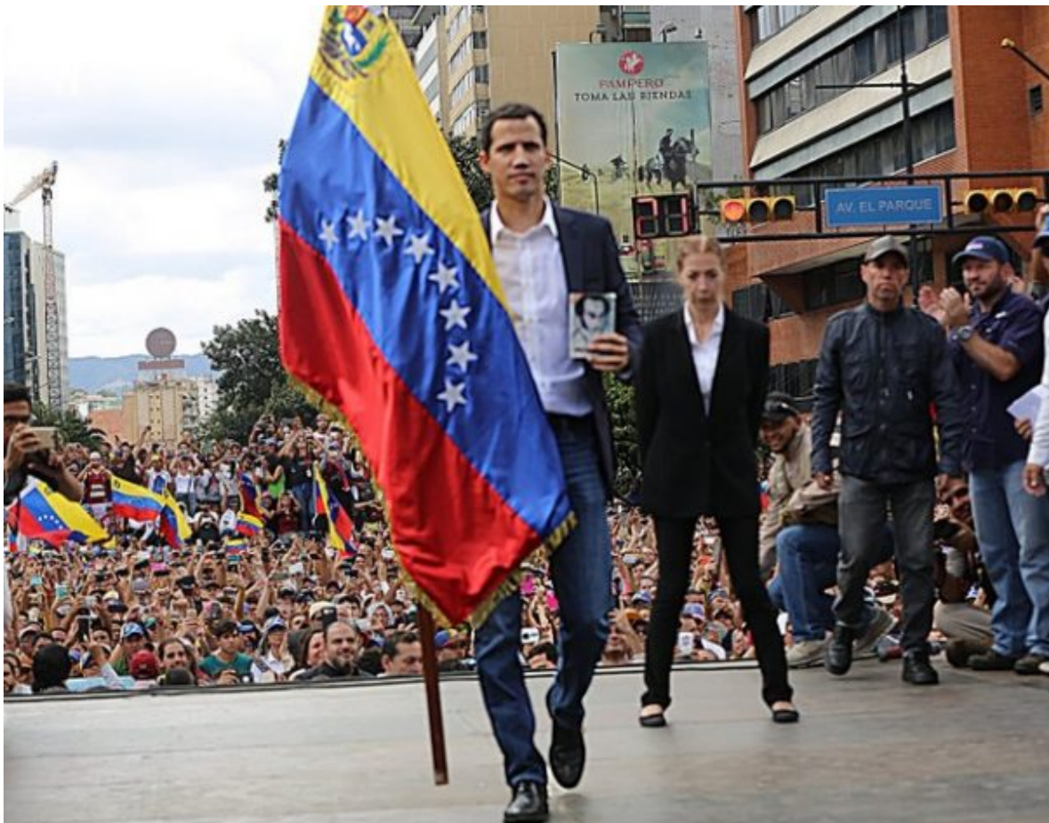
Guido sworn in as Venezuela’s interim president, Jan. 23.

While the State Department praised the opposition for “providing medical and hygiene attention to over 6,000” Venezuelans, those numbers dwarf in comparison to the 300,000 people CEPR “estimated to be at risk because of lack of access to medicines or treatment... [including] 80,000 people with HIV who have not had antiretroviral treatment since 2017, 16,000 people who need dialysis, 16,000 people with cancer, and 4 million with diabetes and hypertension.”