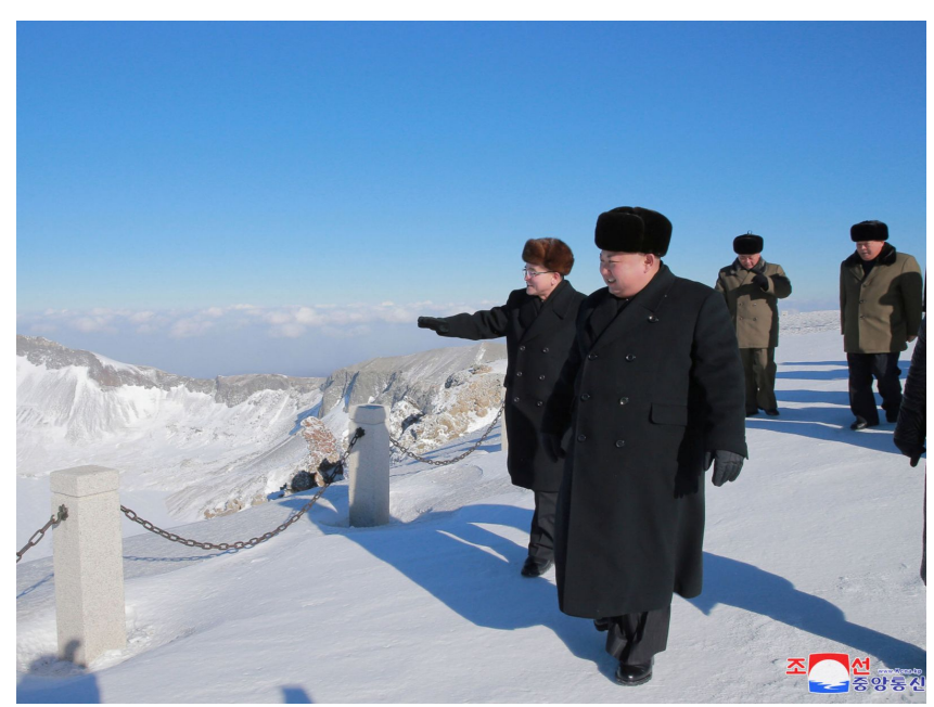
The volcanic Mount Paektu could be at risk

North Korean nuclear tests have been a cause for seismic concern in China before. The test site is less than 100km from the Chinese border and past radiation fears have prompted schools and offices to be evacuated.